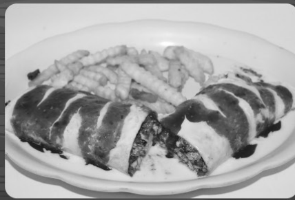
Burrito El Caminante

California style, Chunks of Steak, Avocado, Fries, House Special Sauce. Wrapped around a large homemade Flour Tortilla. Served with Lettuce and Avocado