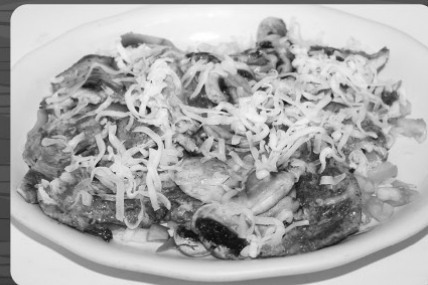
Grilled Chicken Salad