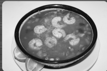
Caldo de Camaron