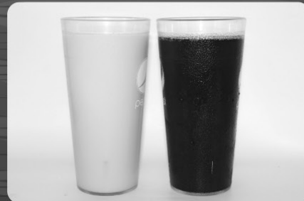
Horchata - Jamaica