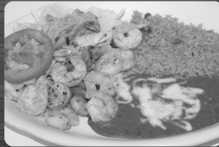
Camarones al Mojo de Ajo