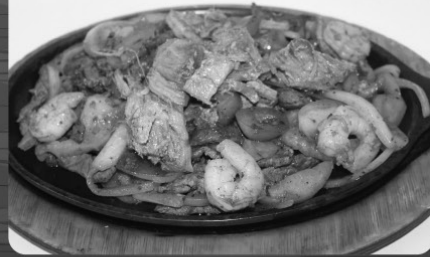
Especial del Pueblo