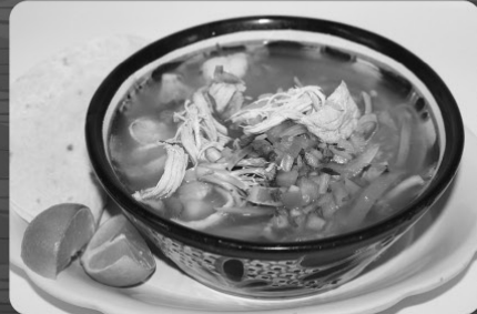
Caldo de Pollo