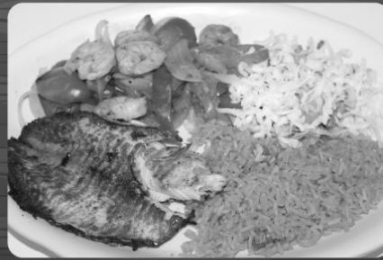
Filete de Pescado con Camarones

FISH TACOS 12.49 Two Tacos with Pico de Gallo, Cabbage, Rice and Beans