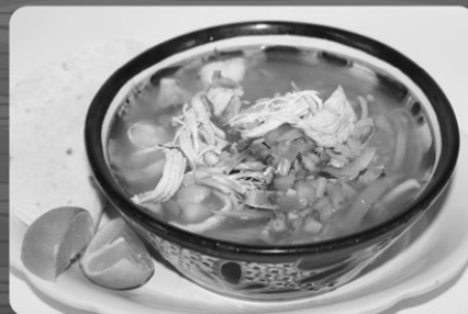
Caldo de Pollo