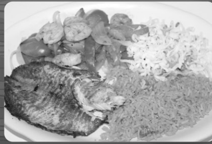
Filete de Pescado con Camarones

Two Tacos with Pico de Gallo, Cabbage, Rice and Beans