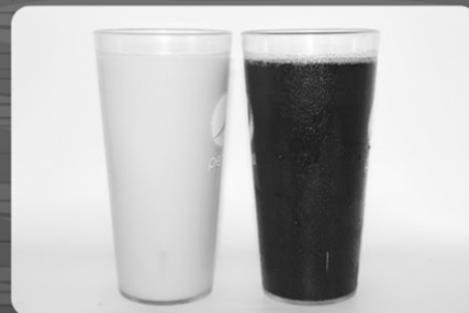
Horchata - Jamaica