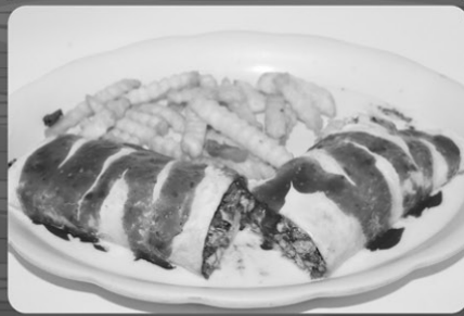
Burrito El Caminante

California style, Chunks of Steak, Avocado, Fries, House Special Sauce. Wrapped around a large homemade Flour Tortilla. Served with Lettuce and Avocado