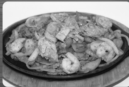
Especial del Pueblo